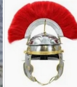
Roman Warrior Centurion... $47.99 Etsy