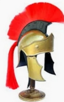
Roman Centurion Re... $112.99 ThugBusters