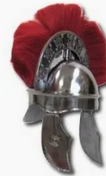
Roman Armor Helmet With... $149.00 Armor Venue