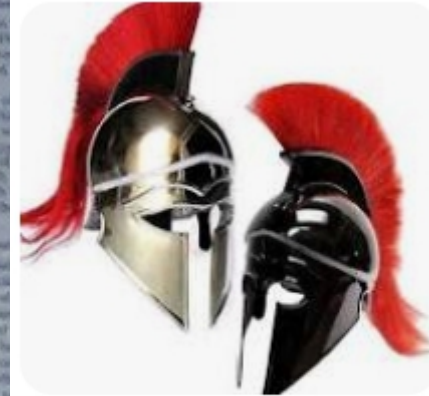
Medieval Greek Corinthian Hel... Walmart