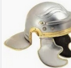
Roman Legion Helmet $119.95 Armor Venue