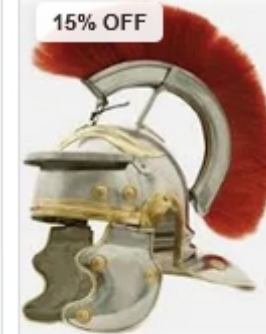
Roman Centurion... $129.95 Hammacher ...