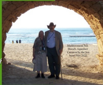
Mediteranean Sea Herods Aqueduct Caesarea by the Sea Israel Nov 2022

God built man with an inner knowledge of the Creator's eternal power and Godhead. Further, God reveals to every man, his wrath against all ungodliness. This true Light "lighteth every man that cometh into the world." Man needs born-again salvation.